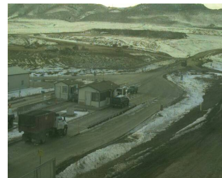
Landfill conditions on 12/28/11, at 1:43 p.m.