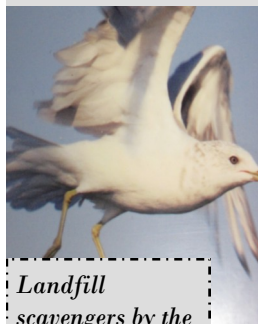
Landfill scavengers by the hundreds!